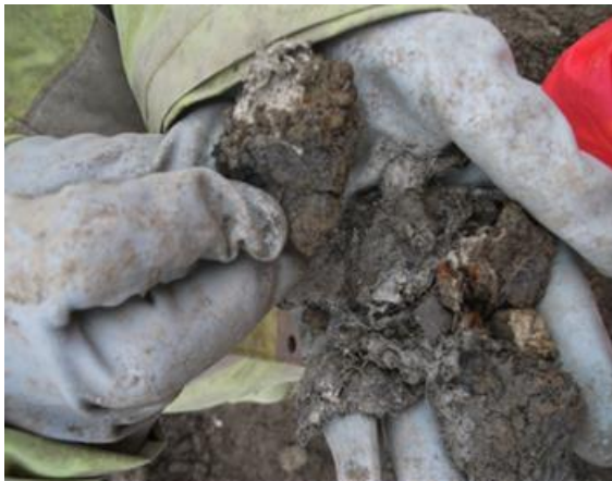
Photo 1. Degraded asbestos material not identifiable as its original product.

Irrespective of the category of work involved, all work must be adequately controlled.