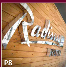
P8 UKATA AGM