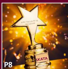
P8 UKATA Excellence Awards