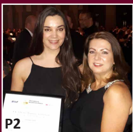
P2 Campaign of the Year Award