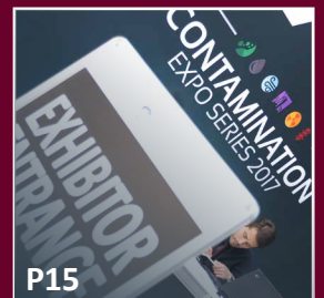
P15 Contamination Expo