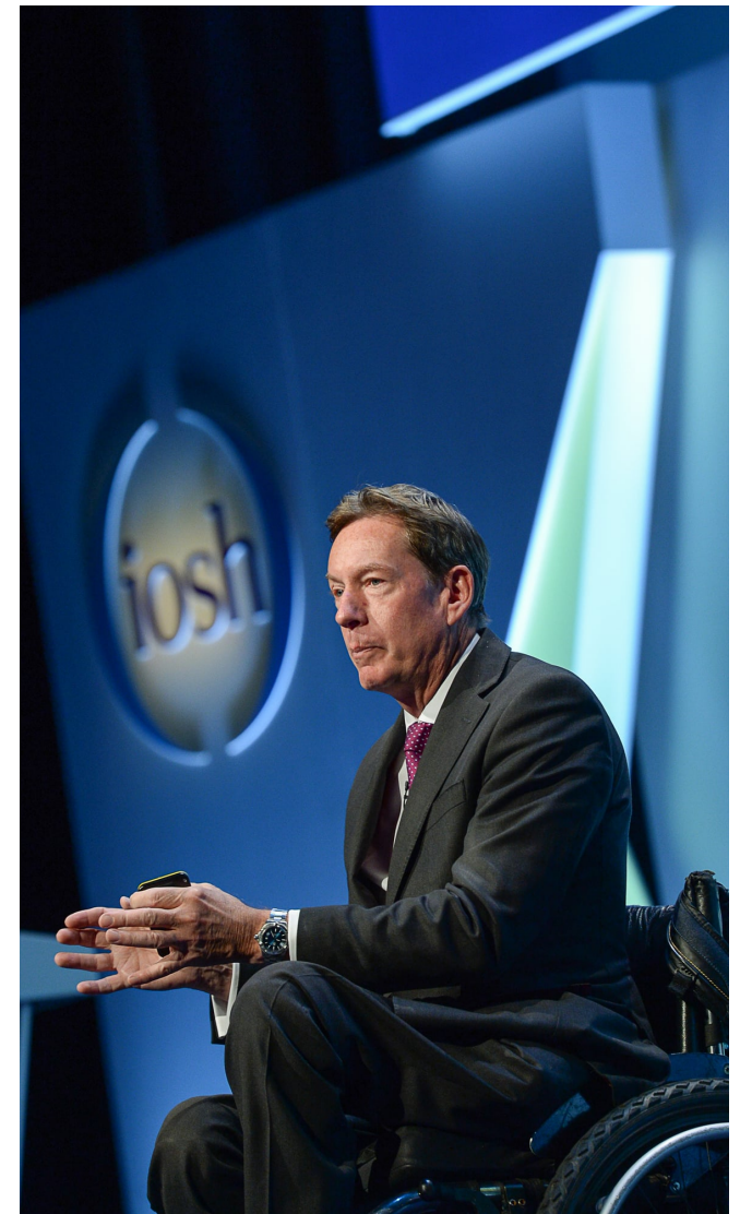
Frank Gardner - BBC Security Correspondent, Journalist & Author

One of the highlights for the UKATA team was the presentation by motivational speaker Frank Gardner, journalist and author. Frank spoke about his personal story of survival and how having a positive mindset and determination helped him recover from his injuries. He shared the strategies he uses to cope with change and how this relates to the business world, calling for everyone to be sensitive to the needs of wheelchair users when considering health and safety. To ask, to listen and not to assume accessibility. He also talked about the challenges of global security and the potential impact this could have health and safety professionals within business.