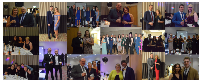
3B Charity Ball 2019

The evenings guest speakers highlighted the poignant purpose of the event which was to address the stigma of poor mental health to promote positive mental wellbeing.