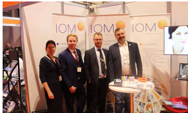
UKATA Senior Management with IOM Consulting

Throughout 2019, IOM Consulting celebrated 50 years of occupational hygiene, laboratory and training services and the team were delighted to attend their 50th anniversary celebrations during the two-day event.