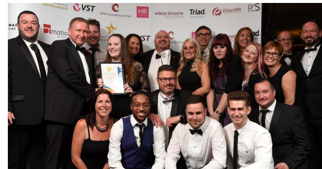
Ensafe crowned 'Employer of the Year'

Ensafe is overjoyed with this achievement and hope to continue their success at future award ceremonies across the country!