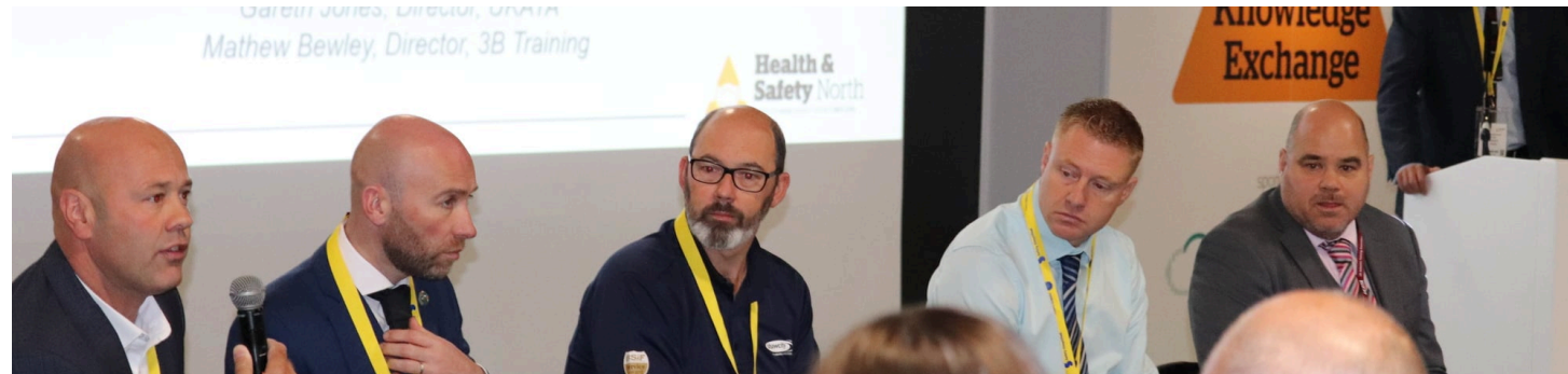
HSM Knowledge Exchange

Over 2000 industry professionals attended throughout the two-day event, all having the opportunity to attend free Knowledge Exchange Seminars presented by leading industry speakers.